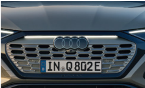
Singleframe projection light