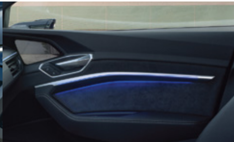
Ambient lighting package plus